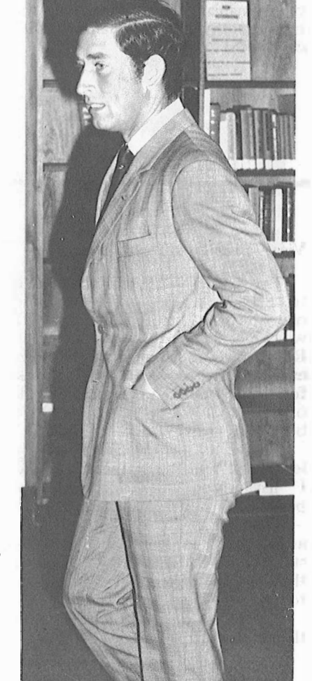
HRH in the Library