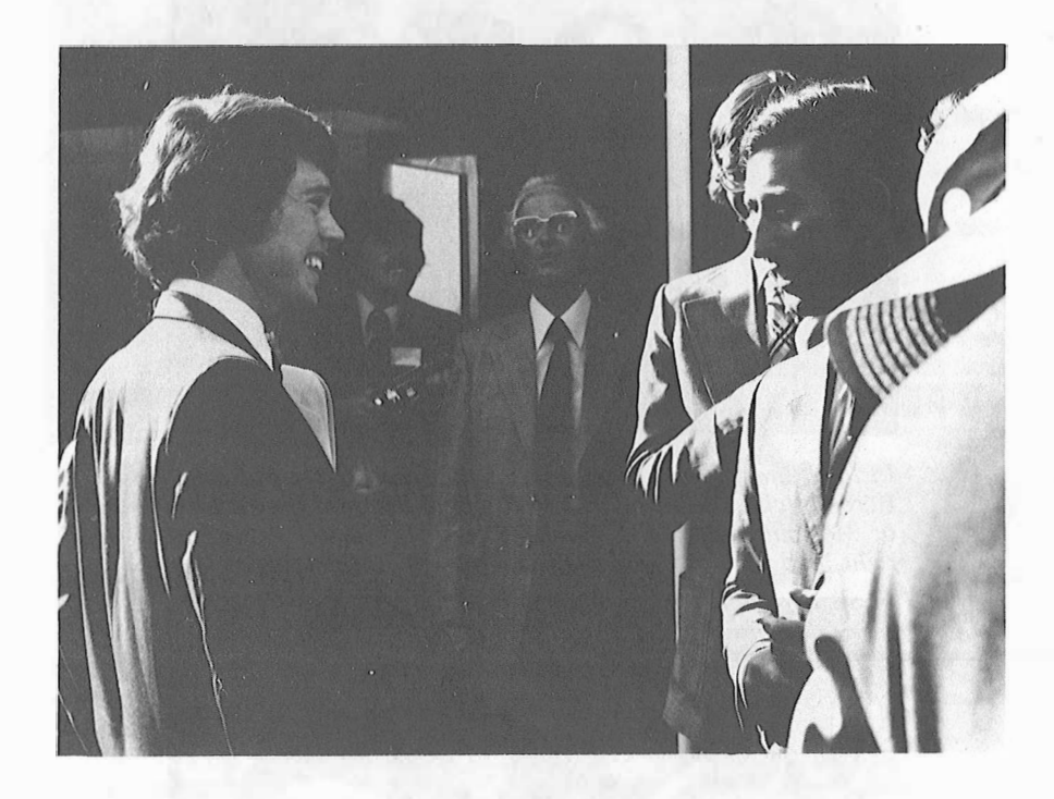
Meeting students on the lawn of Christ College. The security officer, centre, seems to be looking for the next water bomb.