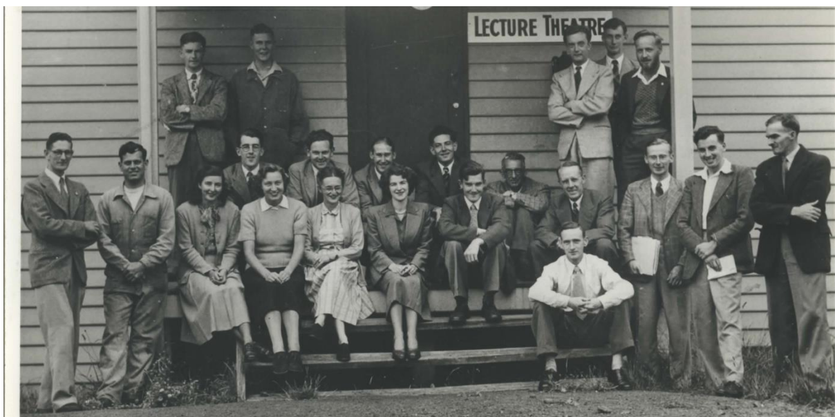
The Physics academic and technical staff, and senior students at Sandy Bay outside the old Lecture Theatre amongst the Army Huts ca 1952

While the future of the University at its Sandy Bay campus is so uncertain, it is more important than ever that its past there is not forgotten. At aged 94, I may be the only one who can remember the beginning of the University in Sandy Bay when Physics was the first department to move to the Army Huts at the old Rifle Range. This is an attempt to document some of those memories.