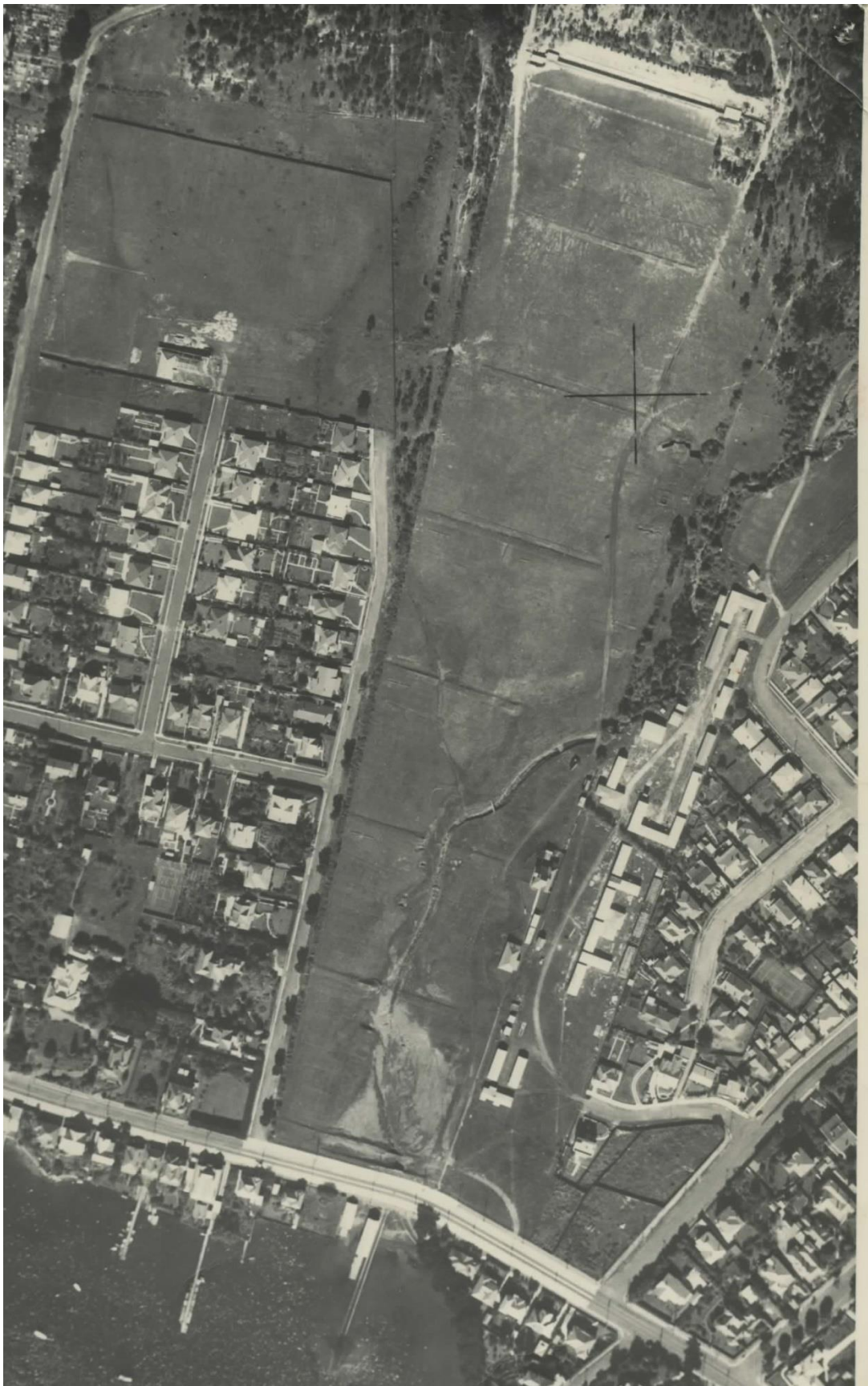
The Rifle Range in about 1948. The Army Huts are at the right, with Physics in the main group at the top